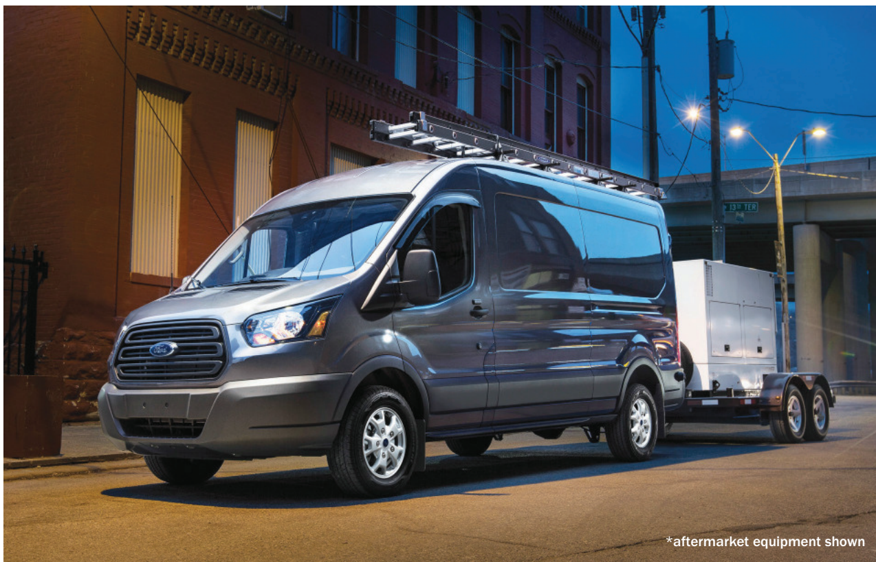
*aftermarket equipment shown