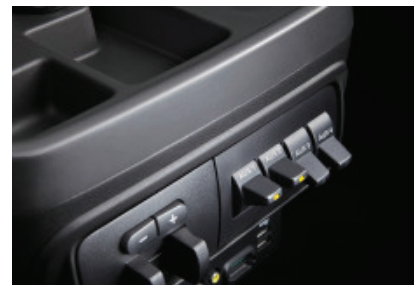
Available Ford Transit upfitter switches.

A range of new technologies are hitting the commercial vehicle market. Backup cameras, crash avoidance systems, and more driver comfort features are