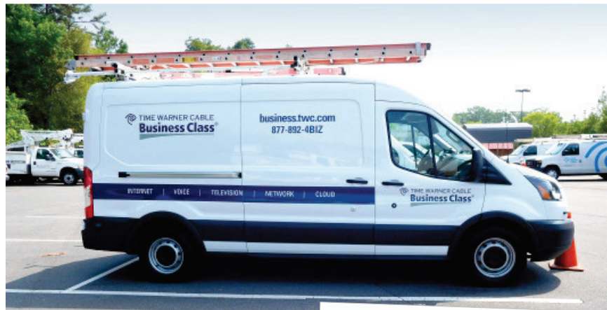
Time Warner Cable is creating a more usable space in the rear of its full-size Transit Vans, and with the medium-height roof, workers are able to stand and easily access equipment. The company is also standardizing the upfits where possible.

With the rollout of about 100 Transit Connects a year and a planned rollout of about 500-700 Transits a year until