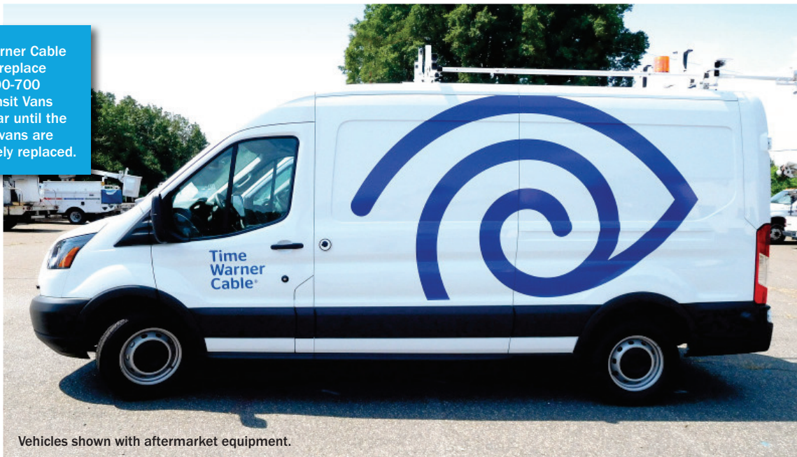
Vehicles shown with aftermarket equipment.

Time Warner Cable plans to replace about 500-700 Ford Transit Vans every year until the E-Series vans are completely replaced.